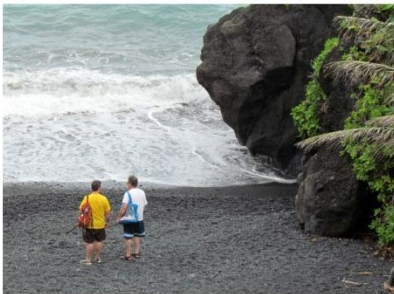
Wai'anapanapa Black Sand Beach