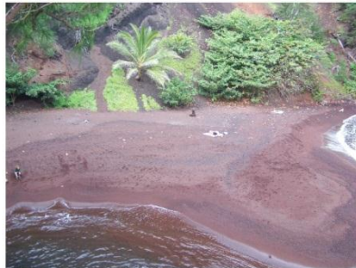
Red Sand Beach