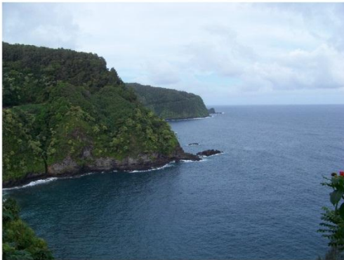
taken from the road