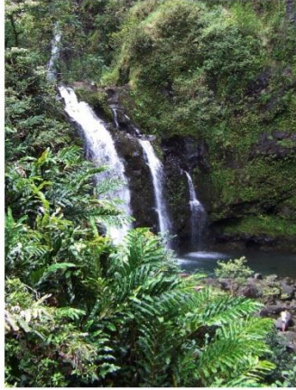
3 Bears Falls