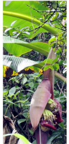
I was so happy to get a picture of these bananas. That's the banana's flower hanging towards the ground. It produces liquid nectar that tastes sweet. Even the flower can be eaten. It's a mystery on what the top right plant is...looks like bunches of bananas growing downward.