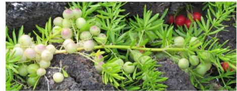
These last five photos are yet to be identified