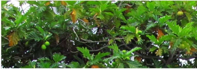
Came across some trees with green fruit that looks like limes...but different leaves.