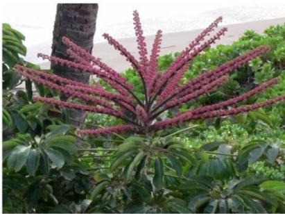
Octopus Tree Berries