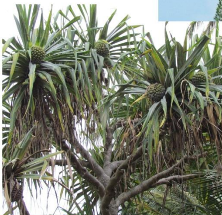
Hala Tree's Fruit