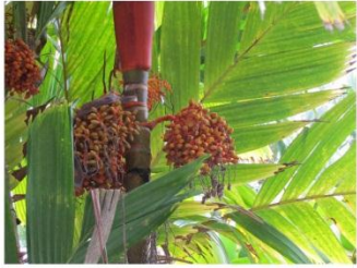
Pejibaye , a relative of the coconut - grow in clusters on palm trees, like miniature coconuts. The part that you eat would correspond to the fibrous husk, while the hard pejibaye seed, when cracked open, reveals a thin layer of bitter white meat around a hollow core.